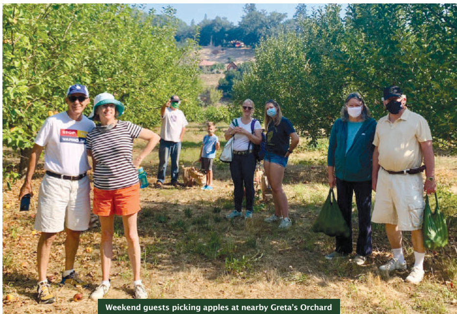
Weekend guests picking apples at nearby Greta's Orchard