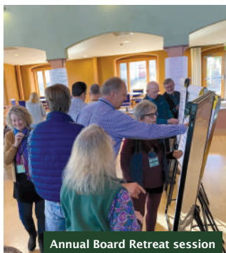
Annual Board Retreat session