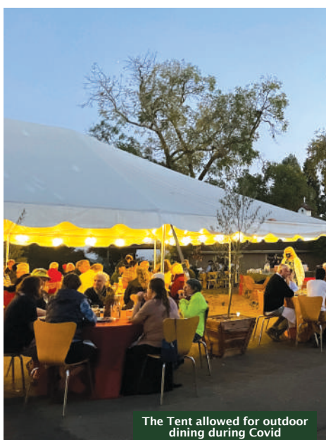
The Tent allowed for outdoor dining during Covid