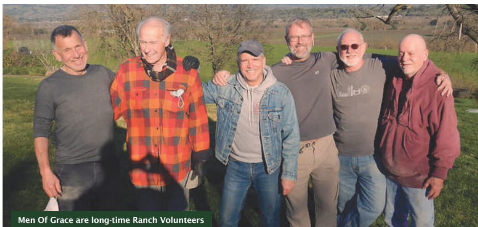
Men Of Grace are long-time Ranch Volunteers