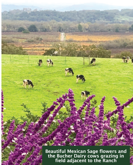
Beautiful Mexican Sage flowers and the Bucher Dairy cows grazing in field adjacent to the Ranch