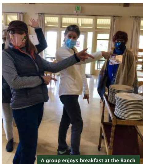
A group enjoys breakfast at the Ranch