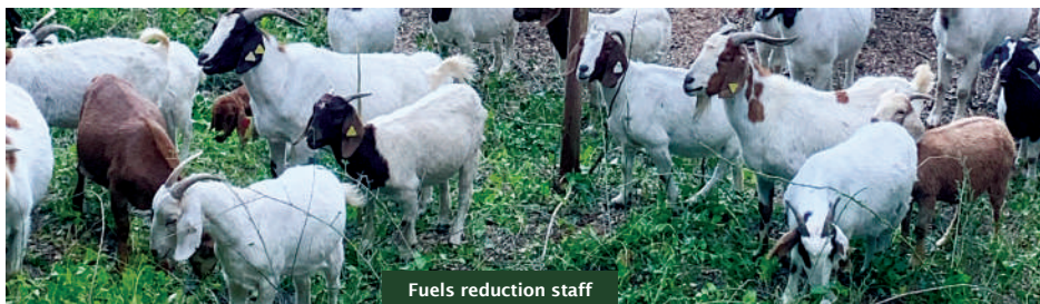
Fuels reduction staff