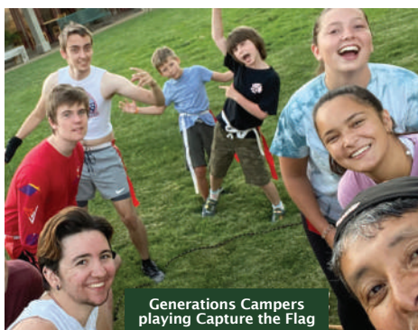
Generations Campers playing Capture the Flag