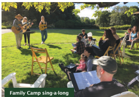
Family Camp sing-a-long