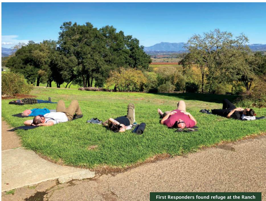
First Responders found refuge at the Ranch