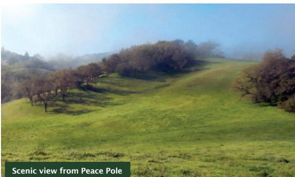
Scenic view from Peace Pole