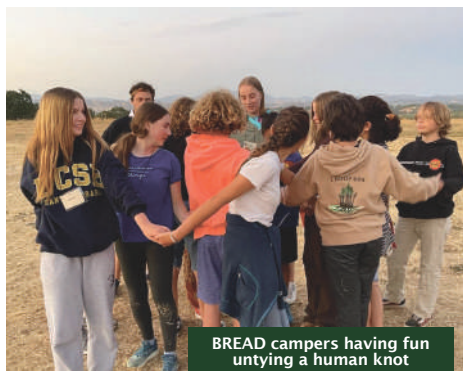
BREAD campers having fun untying a human knot