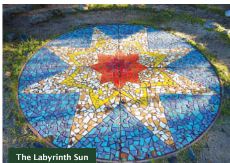
The Labyrinth Sun