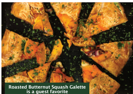
Roasted Butternut Squash Galette is a guest favorite