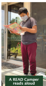
A READ Camper reads aloud