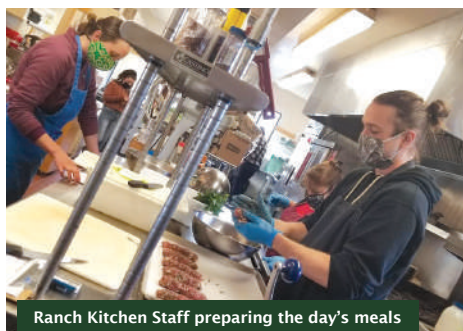
Ranch Kitchen Staff preparing the day's meals