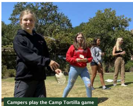
Campers play the Camp Tortilla game