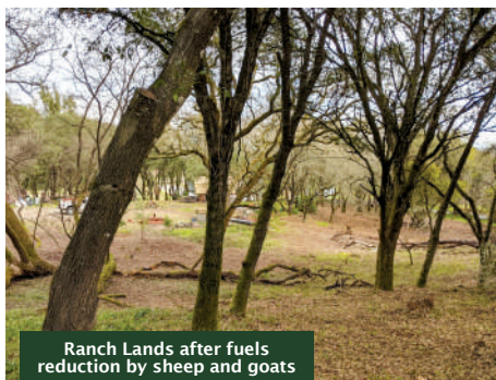
Ranch Lands after fuels reduction by sheep and goats