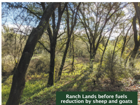
Ranch Lands before fuels reduction by sheep and goats