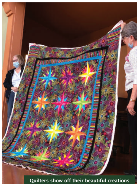
Quilters show off their beautiful creations