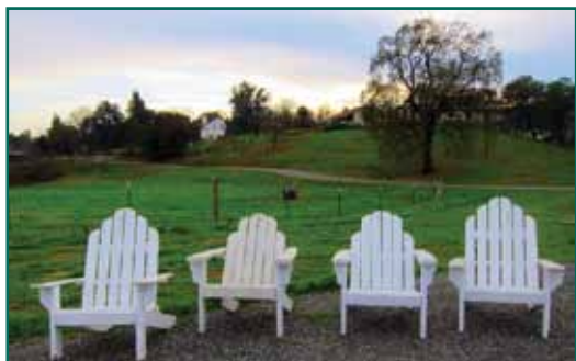
Adirondack chairs with chapel in the distance

We want to gather information in an inclusive process from those who use the Ranch and would love to hear your thoughts. Over the next several months, when you are at the Ranch you may fill out an opinion invitation in the Refectory. Or anytime please visit the Ranch website www.bishopsranch.org . Under the "About" tab, you will see "Master Plan." Here you can learn more about the planning efforts and share your opinion. You may also email Sean Swift at sean@bishopsranch.org