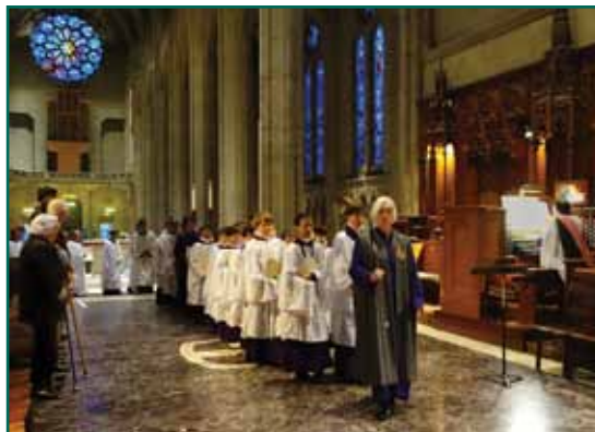
Celebration of Evensong at Grace Cathedral