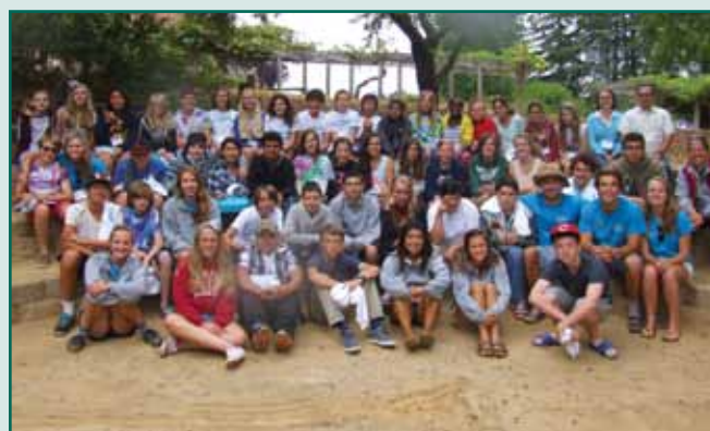
BREAD 2 Summer 2014—put yourself in the picture for 2015!

For more information and registration forms go to http://www.bishopsranch.org/programs-retreats/summer-camps/