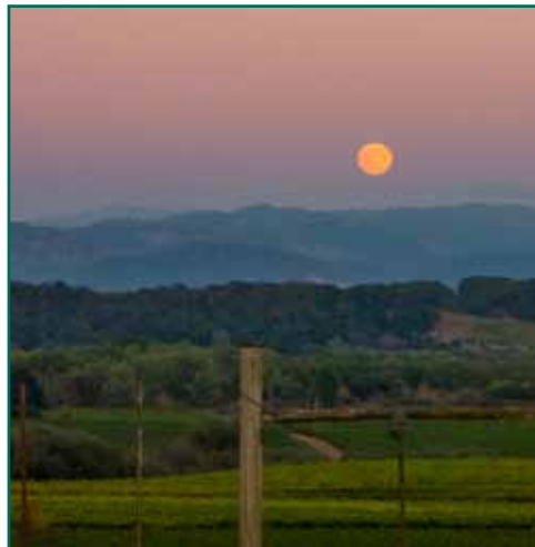
Evening approaches as the moon rises over the hills. Photo taken from the ball field by Dickson Yeager.

That field is simply known as the "Ball Field," but don't let that simple name fool you. This is a magical place, a "thin place," as the Celts would say. Early, on a clear morning from its center you can watch the world wake up, come alive, as the deep purple of night gives way to the golden glow of first light. Signs of life grow exponentially as the sun breaks the horizon.