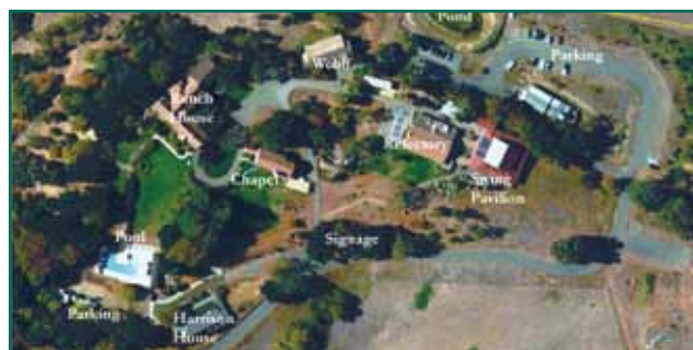
Aerial view of The Bishop's Ranch