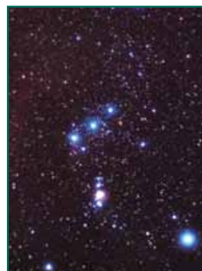
Orion's Belt is the three stars in a row

Years ago, when I lived in San Francisco, I would often head out to Golden Gate Park for a run after work. On winter evenings it would be dark, and as I made my way into the park the reduction of ambient light allowed the stars to stand out against the trees. The constellation Orion, with its iconic belt of three brilliant stars, often seemed to leap out, and I would find myself