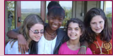
Jr High BREAD