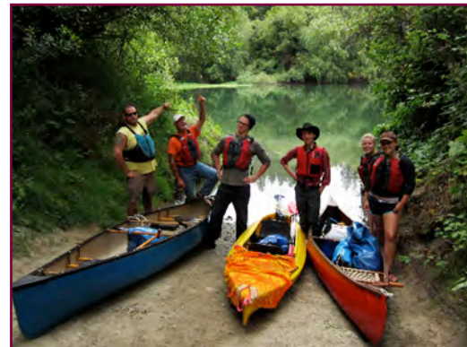
The first intrepid EcoPilgrims