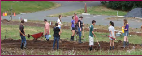
St. James Youth Group digs into the garden

Teens with tools converged upon The Bishop's Ranch, skirting rainstorms in June, to start a vegetable garden. The unusual weather proved little barrier to a hard-working and industrious youth group from St. James Episcopal Church in San Francisco, who spent a week completing this service project with our maintenance crew. By week's end, the group expanded a 100-square foot "double-dig" garden plot into a 1,000 square foot groomed garden. The teens laid the foundation for a kitchen garden on the land, trenching water lines, working compost into the soil, shaping the growing beds, and transplanting starts. Corn, Swiss chard, zucchini, yellow squash, broccoli, cauliflower, pole beans, tomatoes, and tomatillos are now in full production. These crops are beginning to show up in the delicious meals served at The Ranch.