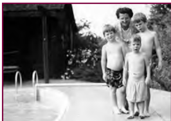
Pool area circa 1960

For 63 years the Ranch swimming pool has been providing refreshment to people of all ages. Children have learned to swim there, courtships have begun there and countless people have enjoyed the sun and relaxing moments in the water. The pool was built by the White family in 1930. It is now over 80 years old and regularly