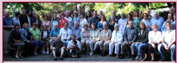
Acorn Society, Ranch Board and friends, July 2011

Thanks to all who attended the forum and to those who