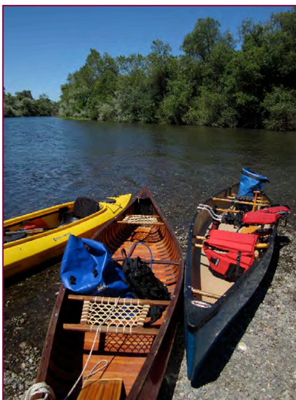
Along the Russian River during the EcoPilgrimage

In the launched craft, I come back to myself and glance at my companions. I see with relief they haven't noticed my untimely river daydream. When a small group of us from St. Dorothy's and the Ranch launched these little boats in July, we gave ourselves over to a realm of larger forces, where wind and current and sun act directly and unarguably against body and boat. Now, we must pay attention: the first little run below us is tricky, past some sharp rocks and under a low brige. This is EcoPilgrimage, giving over to larger forces, with faith.