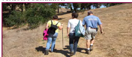
Hikers on the Loop Trail

Bank of America Foundation The Mervyn L. Brenner Foundation, Inc. Episcopal Diocese of California Fidelity Charitable Gift Fund Grace Cathedral, San Francisco Maria Kip Orphanage Fund Men of Grace Cathedral The Joy L. Robinson Fund (an advised fund of the Silicon Valley Community Foundation) San Francisco Foundation Schwab Charitable Fund United Way of the Bay Area Verizon Foundation