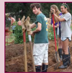
Checking their progress

compost sits at the upslope side of the garden, awaiting our next volunteer group. With a few willing hands, we can double the current garden size to 2,000 square feet, and produce more food for the kitchen and guests at the Ranch. If this activity interests you, please contact us and we will set up a service project during your next stay.