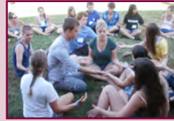
Sr High BREAD