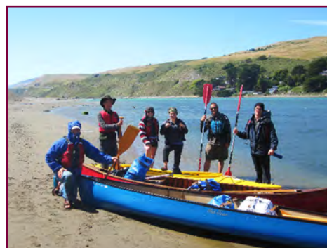
Jenner, where the Russian River meets the Pacific