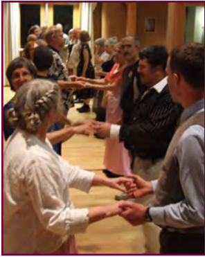
Country Dancers in Swing Pavilion

These names reflect gifts or pledge payments received between March 1, 2011 and August 31, 2011. If you sent in a contribution during this time and your name is not here, we apologize. Please contact us to let us know. If we received a contribution after August 31, 2011 your name will appear in the next newsletter.