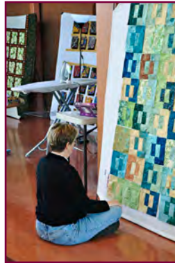
Eleanor at work

In both quilting and cooking, there is the same endless repetition of actions over and over again. Cut. Sew. Press. Slice. Stir. Taste. These moments of quiet repetition become a meditative practice and allow space for inspiration and magic to happen. And, when you are doing this with a group of people who are all doing the same thing in the same space, the force and power is magnified. It is a privilege to be a part of both of these communities. See page 8 for dates of upcoming Ranch Quilt Retreat.