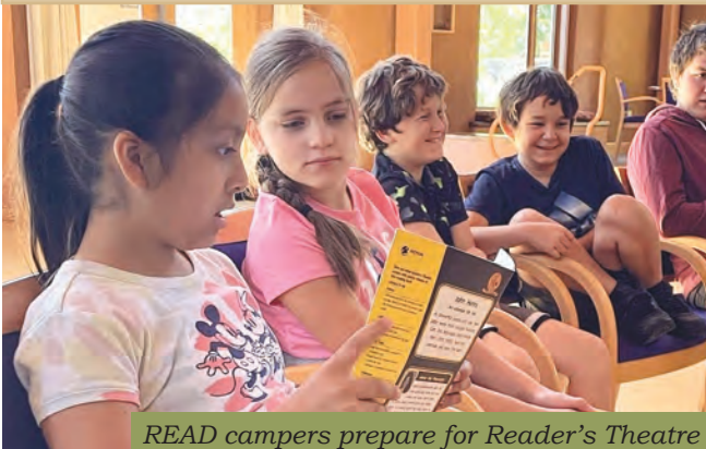
READ campers prepare for Reader's Theatre