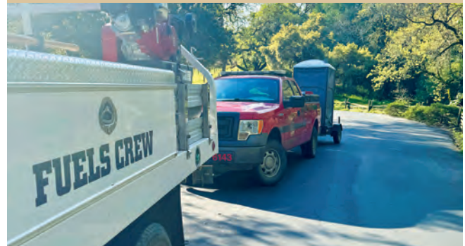
Fuels Crews line up at The Ranch

Cal Fire and the Northern Sonoma County Fire District have been on-site for several weeks now, clearing fire fuels and vegetation overgrowth from several areas along Westside Road and in Gina’s Orchard. They will continue their work into April. Later in the year, The Ranch will serve as a demonstration site for pile-burning training. This vital work is made possible by a $350,000 Cal Fire grant awarded to The Northern Sonoma County Fire District in partnership with our C.O.P.E Westside Community to complete extensive work along Westside Road. Many thanks to our Fire Chief, Marshall Turbeville, and board member Marjorie Sun for their roles in helping secure this grant.