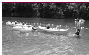
A Russian River field trip.