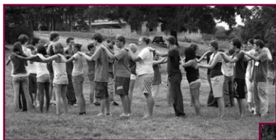
At BREAD camp young people form a loving, supportive community, discuss relevant topics and have lots of fun.

Summer at the Ranch brings many sounds which, when listened to closely, can sound like the voice of God. Come listen with us sometime.