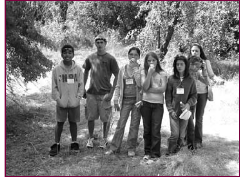
Jr High BREAD campers stop to pick and enjoy apples on their hike through the watershed

This summer the BREAD campers were able to experience guided walks in unspoiled nature. As they walked, they