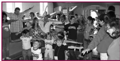
Family-friendly worship in the chapel.