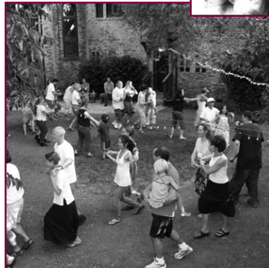
Family Camp and Generations Camp are places where families find out what kind of community can develop when God's children of all ages gather to work, play, relax and talk.