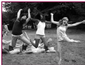
Can you catch the spirit?