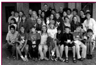
Choral Music Camp, where campers spend the week learning a musical production and having other fun camp experiences.